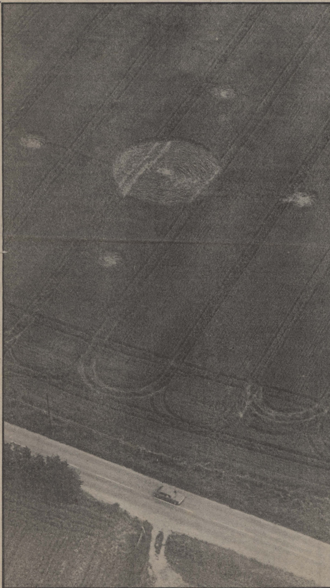
Circles of mystery... the puzzling holes among the tractor marks

And if it turns out that the five mysterious cornfield circles were left by E.T.'s spaceship they will be able to say to a doubting world: "We told you so."